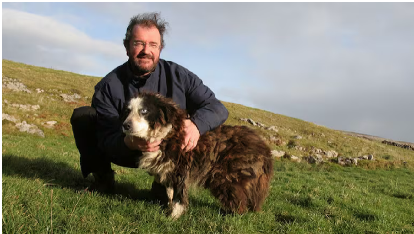
John O'Donohue (1956-2008)

Knox Church values the support of all who are involved in our community's life. Knox Church is a charity. All charitable donations are eligible for a tax rebate of 33%. Bank account - 03 1705 0029641 00. Put your name in the reference field and email your contact details to the office. For further information or options contact: office@knoxchurch.co.nz ph: 379 2456.